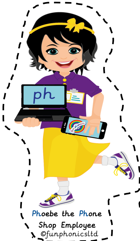
Phoebe the Phone Shop Employee @funphonicsltd