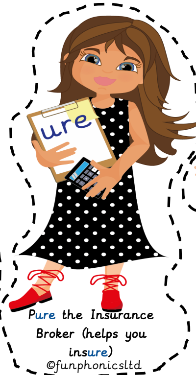
Pure the Insurance Broker (helps you insure)