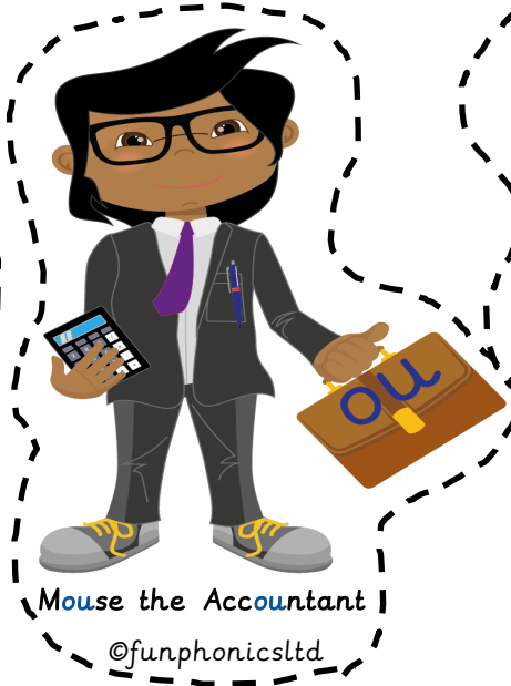
Mouse the Accountant @funphonicsltd