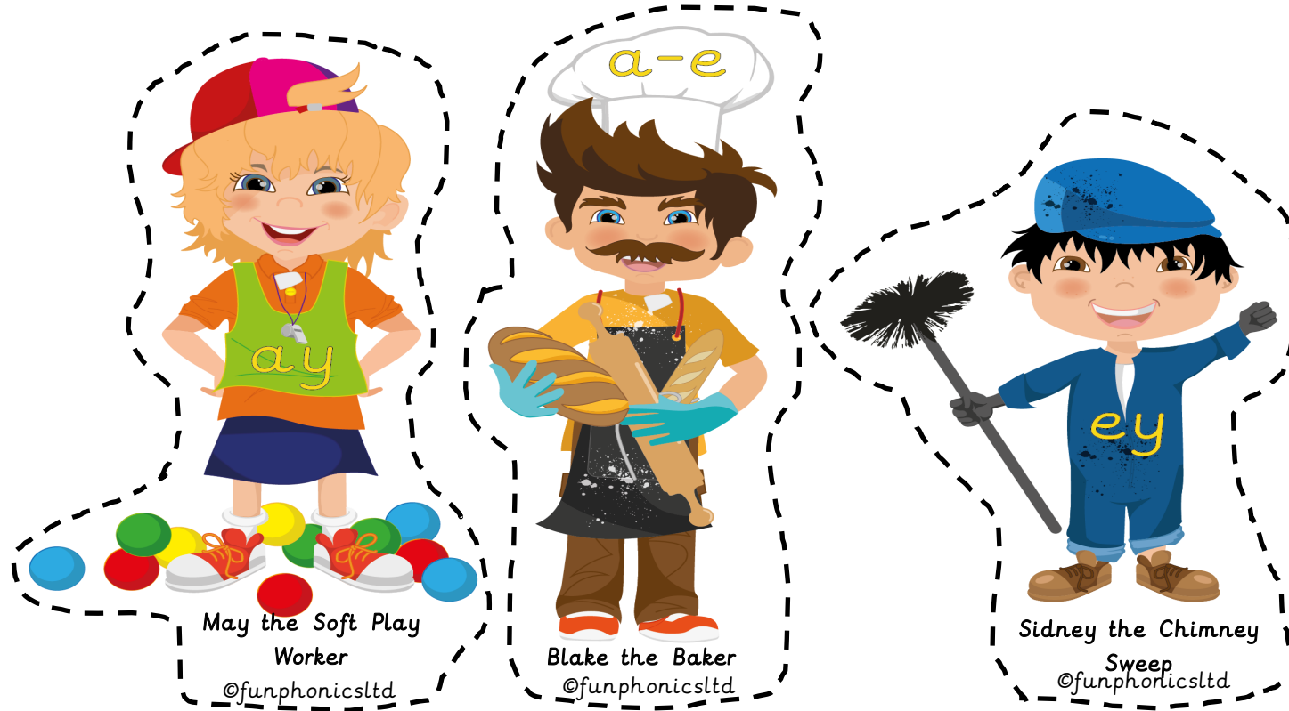
May the Soft Play Worker