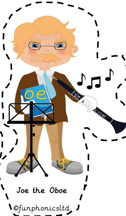
Joe the Oboe @funphonicsltd