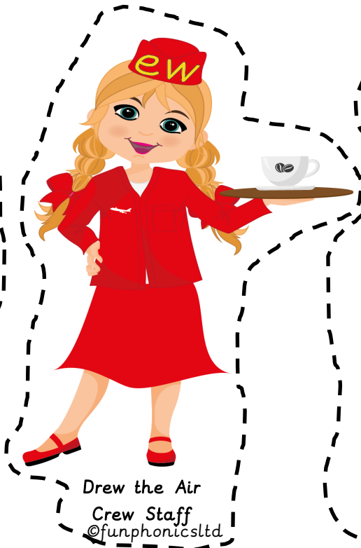
Drew the Air Crew Staff @funphonicsltd